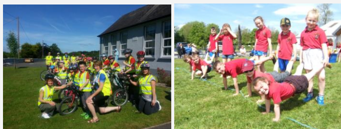
Our cycling challenge... Finale! Our Sport's Day...