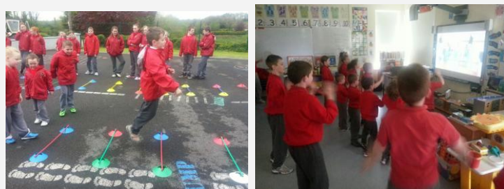
Practising agility skills... We danced...