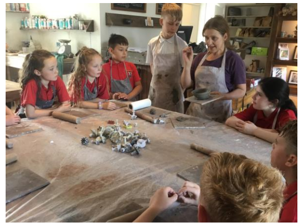
'Learning about Clay Creations, Glaslough' 2023