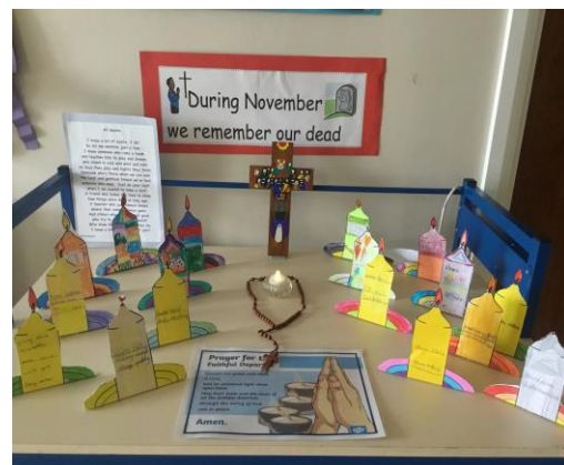
Remembering our dead during November 2023'

As a Catholic school we support parents and the wider parish in nurturing the growth of faith and Christian living in the child. Religious education is provided for Catholic children attending the school and appropriate arrangements are made with parents who wish to absent their children from attending classes related to the preparation for the sacraments. Through the Grow in Love Programme we prepare the children for the reception of the Sacraments of First Confession, First Holy Communion and Confirmation.