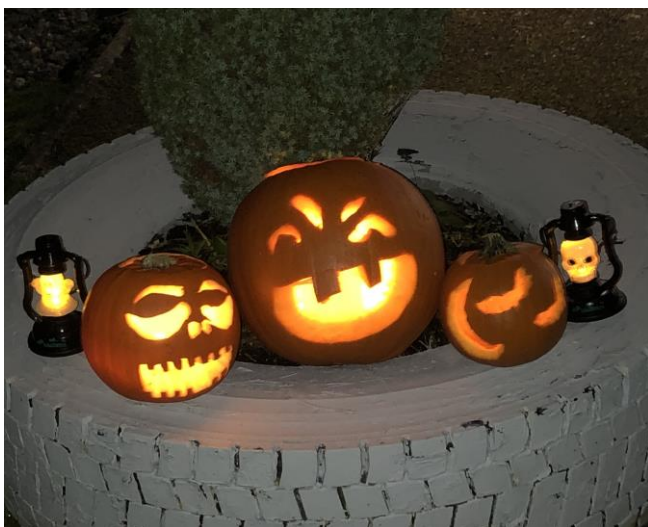
Spooktacular scenes at St. Comgall's N.S. 2023