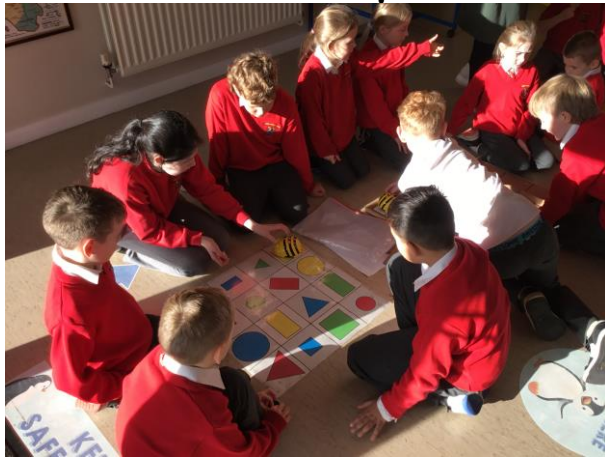
'Learning about Beebots 2023