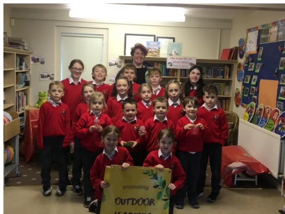
"Working towards our Fifth Green Flag on 'Biodiversity'"

Through our school garden we also strive to help children become aware of, acknowledge and appreciate environmental and planetary issues.