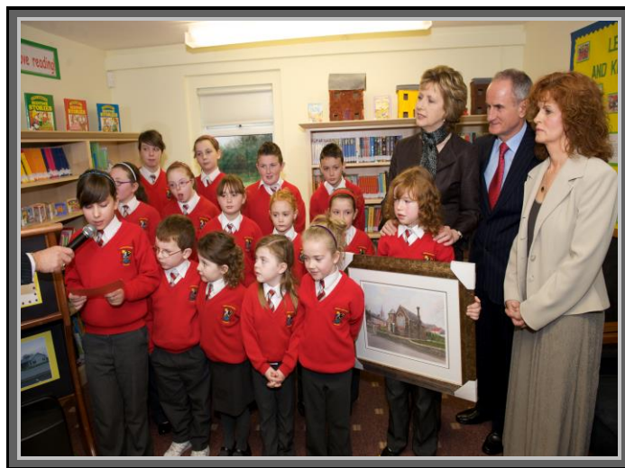
'President McAleese visited St. Comgall's N.S.'

The accommodation comprises of two interactive whiteboard resourced classrooms, a multi-purpose classroom, P.E. and equipment storerooms and special needs toilet facilities. There is also an attractive welcoming reception area equipped with library resources, a staffroom and a Principal's office in the building. Outside boasts landscaped gardens, two substantial tarmaced playground areas with a wooden playground and poly-tunnel in the rear playground. Indeed, our school looks out on an idyllic, peaceful setting with St. Alphonsus' Church across the road and our community hall, football field and tennis court located adjacent to the school.