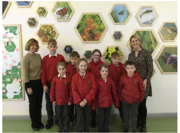
'Our Biodiversity Committee visited Knocknagrave Environmental Centre' 2023

As part of the school philosophy, teachers endeavour to provide as many practical experiences as possible. One aspect of this is to take the pupils on educational outings. These are usually used as a focus or a culminating activity to a unit of work and the experiences lead to activities related to all aspects of the curriculum. They are also used to develop social skills. Parents are informed in advance of the purpose, the details of travelling and the cost. At the beginning of each year parents are also asked to sign a consent form allowing their child/children to go on these trips.