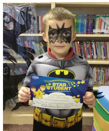
"Star Student" is a weekly award

N.B. Acceptance of admission to the school implies the parents' acceptance of the school's Code of Discipline.