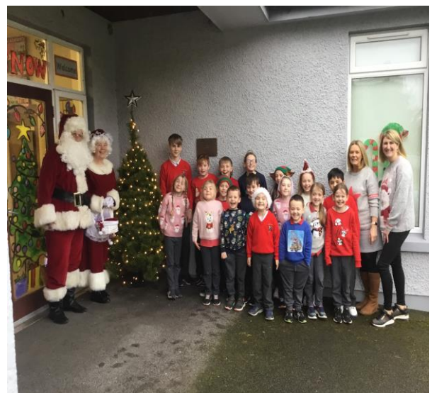
Celebrating Christmas with Santa and Mrs Claus 2023