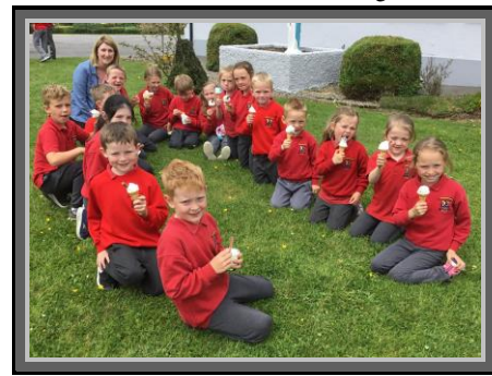
And thank you parents for the ice-creams!