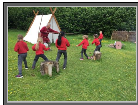
Learning all about the Celts and trying out some Celtic war tactics at Navan Centre and Fort.